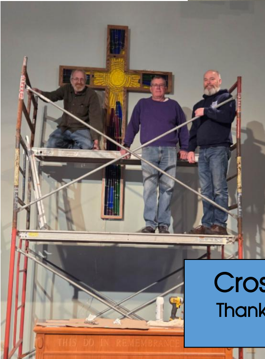
Cross Installation Thank you to everyone involved!